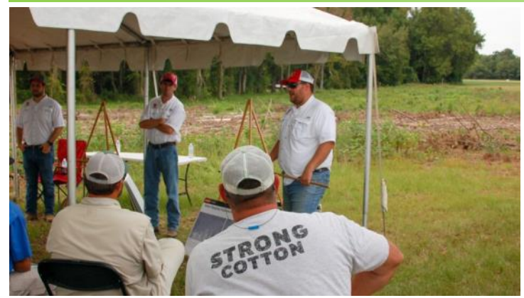
NC State weed science researchers present at a cotton field day